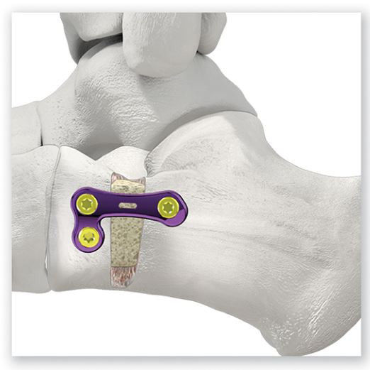
HEvans® plate used in conjunction with PRESERVE™ Evans Graft

All screw holes can accommodate both locking and non-locking 2.7 mm, 3.5 mm and 4.2 mm plate screws